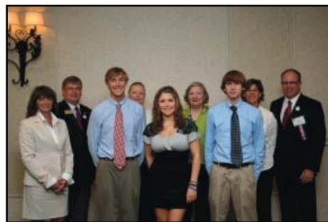
Gr. New Haven Association of REALTORS®